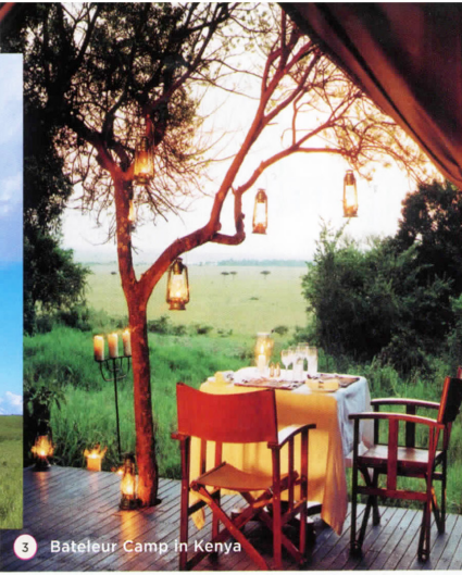
3 Bateleur Camp in Kenya