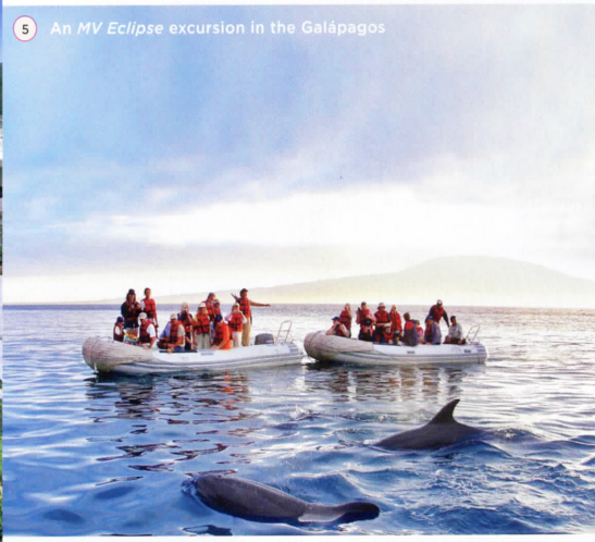
5 An MV Eclipse excursion in the Galápagos

room, and eat dinner at Le Dauphin, a village inn serving duck breast and pigeon to locals and Parisian foodies. Spend another day wandering the medieval streets of Le Mans, an hour north of the Loire Valley, stopping by the Malicorne porcelain factory to buy French country pottery. Le Mans is best known for its racing track, which you can try for yourself (in a Ferrari) at certain times each month. That evening's dinner is at Maison d'Elise, which is in an 18th-century house and attracts a young crowd. In the following days, visit the Loire Valley's Renaissance castles: picnic (on pâté, hard-boiled eggs, crusty bread, and cheese) in the shadow of Chambord's grand towers, walk through the riverside gardens of the majestic Chenonceau, and taste rare Vouvrays in Château de Valmer's pretty cellar. There's also lunch at L'Auberge du Prieuré, on the grounds of Leonardo da Vinci's last home in Le Bourg, where a renowned chef serves a wildly unusual menu of Renaissance-era food: think eel pastries and leek hash paired with Hippocras mulled wine. After that, it's back to Paris for a night at the intimate Hotel Esprit Saint-Germain, and one last tasting through the company Ô Château: wines, cheeses, and charcuterie at lunch in a 17th-century stone cellar.