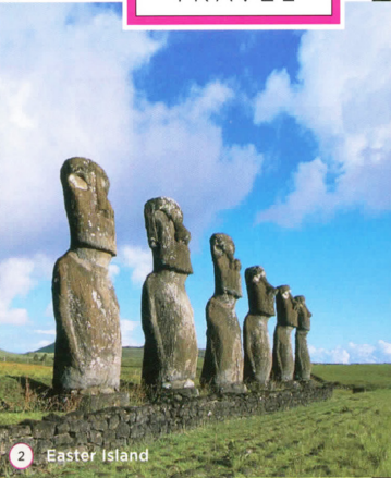
2 Easter Island