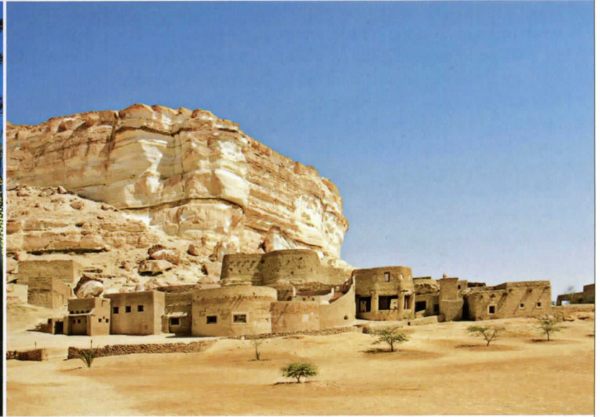
{ Clockwise from top left: The lobby aboard the Sonesta Star Goddess ; the Sphinx; Adrère Amellal eco-lodge in the Siwa Oasis; Four Seasons Resort Sharm El Sheikh . Opposite: Mena House Oberoi in Cairo. }