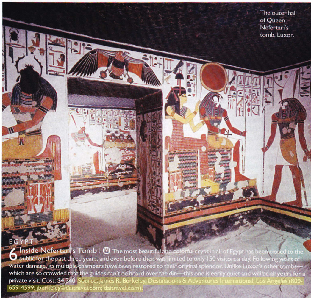
The outer hall of Queen Nefertari's tomb, Luxor.

5 Attend a Famadihana, a Malagasy ceremony in which the deceased are moved between tombs on the anniversary of their death to reaffirm their link with living relatives. Not for the faint of heart, festivities in the village of Soatanana typically last two days and include the sacri-